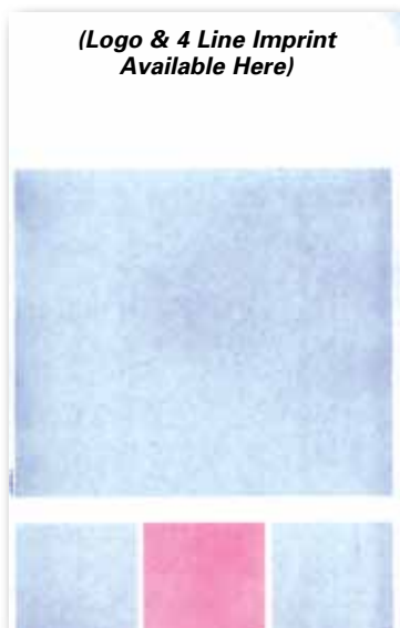
#7402 (Plain) / #7402-IMP (Imprinted) (Form #LZR-SI-14-Blank)