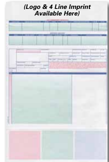
#7398 (Plain) / #7398-IMP (Imprinted) (Form #LZR-RO-14)

This is the repair order for the ERA* System.