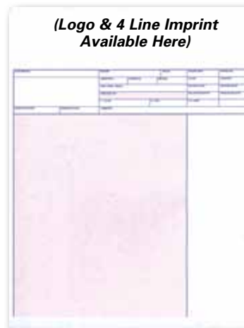
#7400 (Plain) / #7400-IMP (Imprinted) (Form #LZR-SI-11)

This is a Service Invoice for the ERA* System.