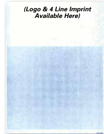
#7393 (Plain) / #7393-IMP (Imprinted) (Form #LZR-RO)