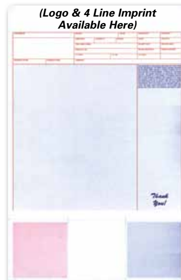
#7404 (Plain) / #7404-IMP (Imprinted) (Form #LZR-SI-14)

This is a Service Invoice for the ERA* System.