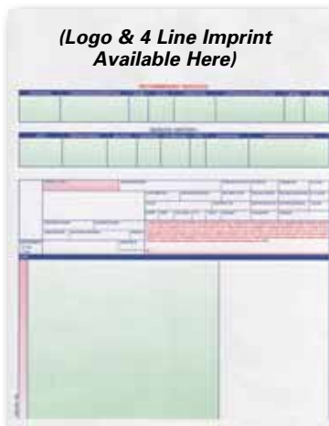
#7395 (Plain) / #7395-IMP (Imprinted) (Form #LZR-RO-11-20)