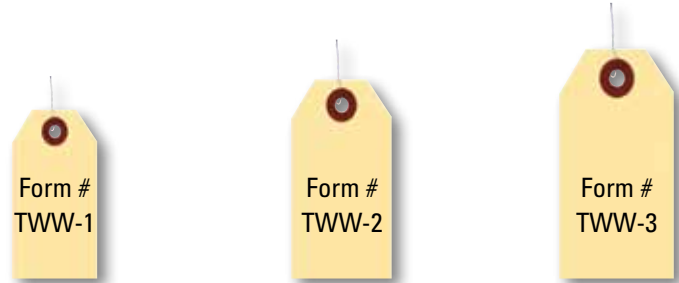
2-3/4" x 1-3/8" #621 (Plain) #621-IMP (Imprinted) 3-1/4" x 1-5/8" #622 (Plain) #622-IMP (Imprinted) 3-3/4" x 1-7/8" #623 (Plain) #623-IMP (Imprinted)

Quantity price breaks for Imprinted are: 1000, 2000, 3000, 5000, 10000